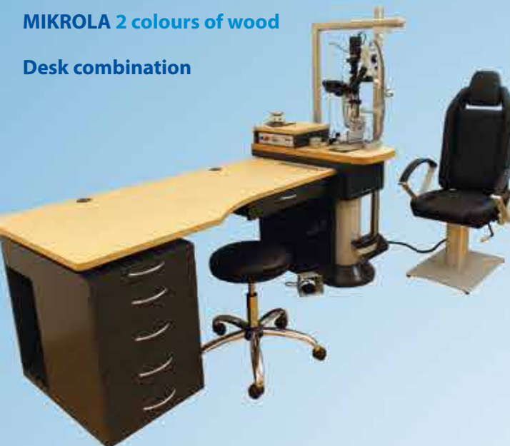
MIKROLA 2 colours of wood Desk combination