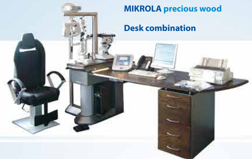
MIKROLA precious wood Desk combination