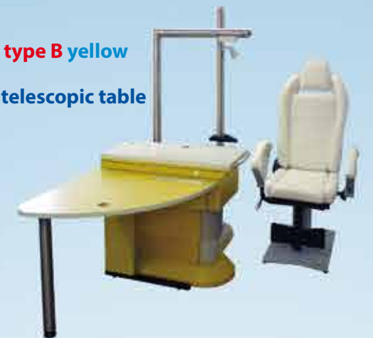
MIKROLA type B yellow 2 devices telescopic table