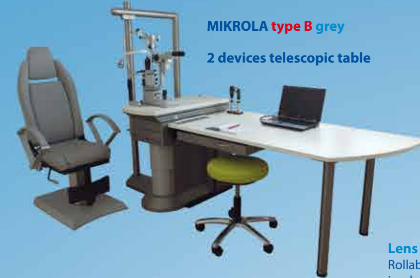
MIKROLA type B grey 2 devices telescopic table