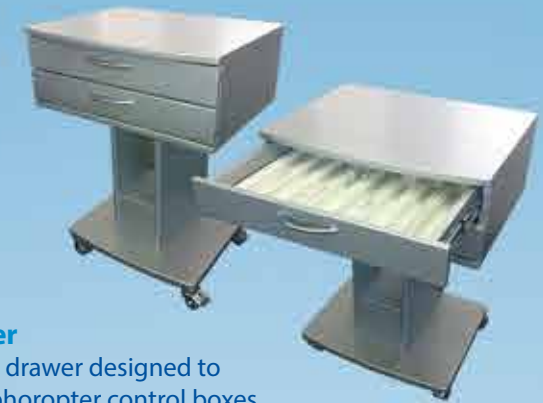
Lens drawer Rollable lens drawer designed to implement phoropter control boxes.